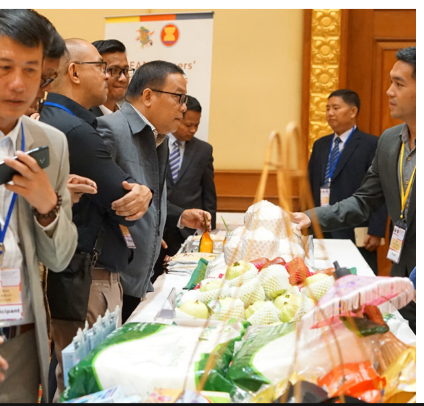
Photo of the 8th ASEAN Cooperative Business Forum, 26 February 2019