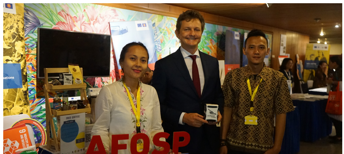
\blacktriangle \ \ Photo\ of\ Farmers\ and\ Cooperative\ Representative\ with\ the\ representative\ of\ EU\ Mission\ to\ ASEAN