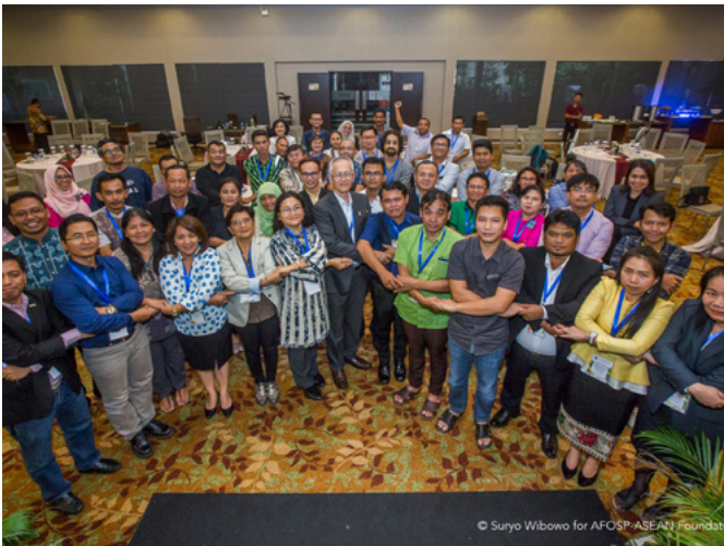
▲ ASEAN Learning Series and Policy Engagement on Agricultural Cooperatives (ALSPEAC), Yogyakarta, 19-21 July 2017