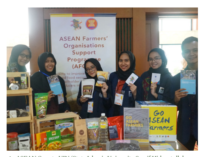
▲ ASEAN Goes to UIN (State Islamic University Syarif Hidayatullah Jakarta) 2019