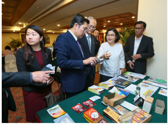
▲ AFOSP attend the 20th ASWGAC and the 25th ACEDAC Meeting, 23-26 July 2018 in Langkawi, Malaysia