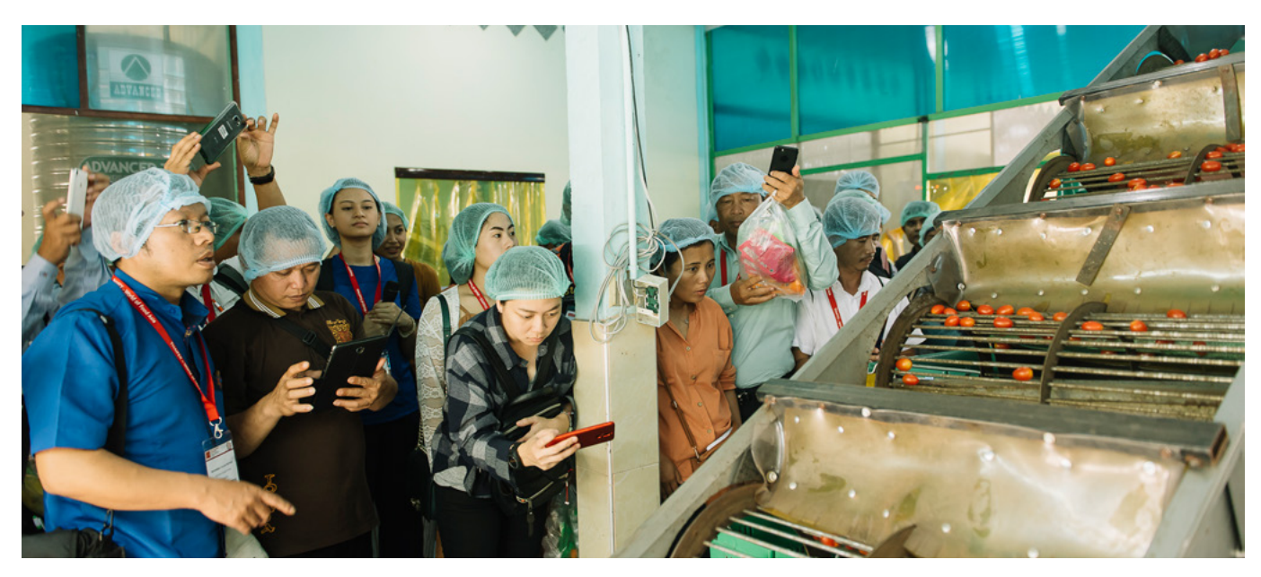
\blacktriangle ASEAN Learning Series 2018 (Field Visit to Tomate Farm) in Thailand