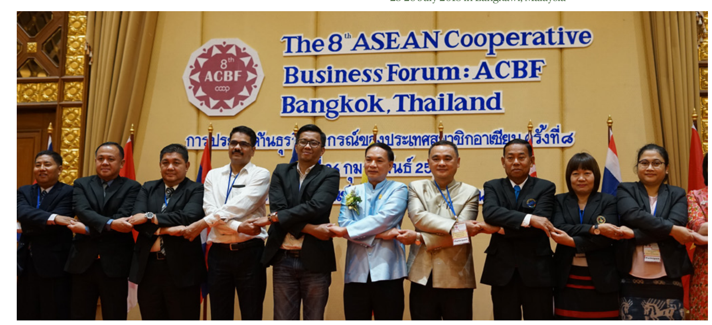
▲ 8th ASEAN Cooperative Business Forum, 26 February 2019 in Bangkok, Thailand