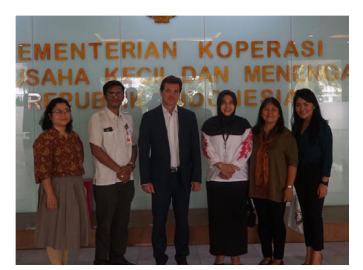
▲ SIS Mission Visit to ACEDAC Secretariat in Jakarta