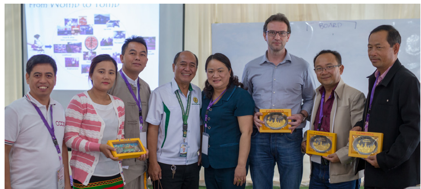
▲ 7th ASEAN Cooperative Business Forum, Manila, 15-18 January 2018