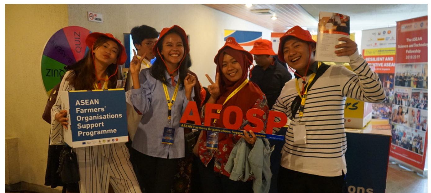
▲ ASEAN-EU Scholarship and Cooperation Day 2018 in ASEAN Secretariat