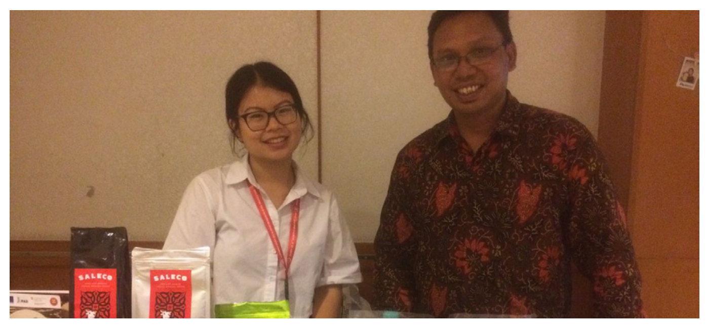
▲ NIA Indonesia and AFOSP Intern attend the ASEAN Youth Expo 2018 in Jakarta