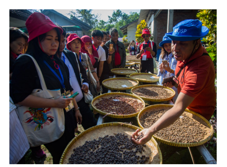
▲ ASEAN Learning Series and Policy Engagement on Agricultural Cooperatives (ALSPEAC), Yogyakarta, 19-21 July 2017