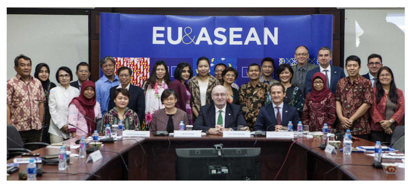
▲ Roundtable Discussion on Strengthening Farmers' Organisations/ Agricultural Cooperatives and Attracting Youth in Agriculture, Jakarta, 7 November 2016 at the ASEAN Foundation